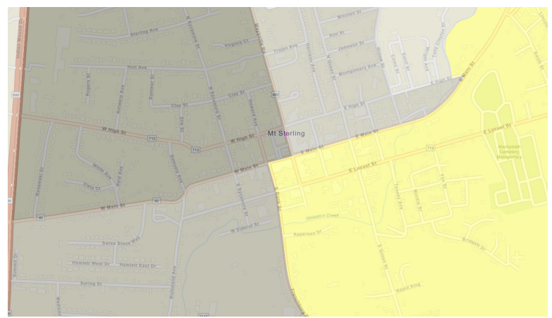
Project Map – MSWS Lead and Copper Line Replacement Project Area

Levee Road Water Association Inc, Montgomery County Water District #1, and Reid Village Water District.